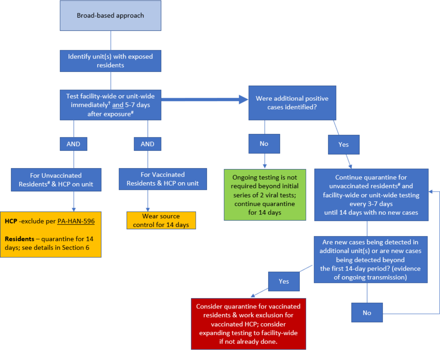
FIGURE 3: IMPLEMENTING A UNIT-BASED OR FACILITY-WIDE APPROACH TO OUTBREAK RESPONSE